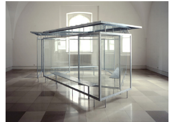
shelters Galerie der Künstler Munich, Germany 2000