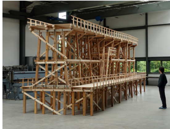
gap Kunststiftung Erich Hauser Rottweil, Germany 2015