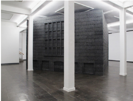
bunker Kunsthalle Recklinghausen, Germany 2014