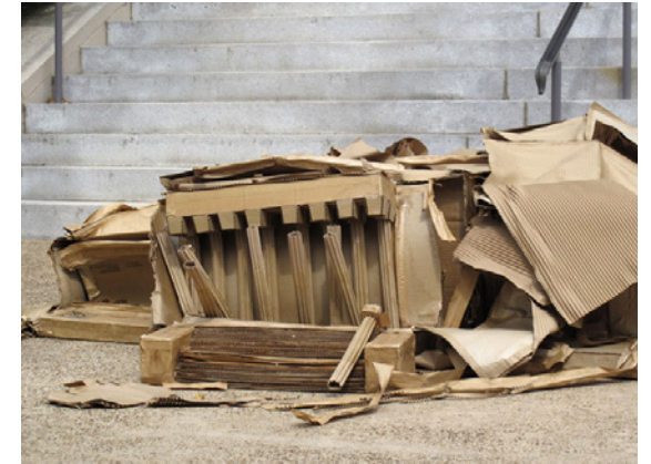
res publica 5x5 Public Art Festival Washington DC 2012