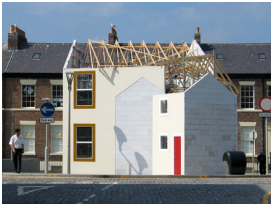
fold-up Sunniside Gardens Sunderland, UK 2008