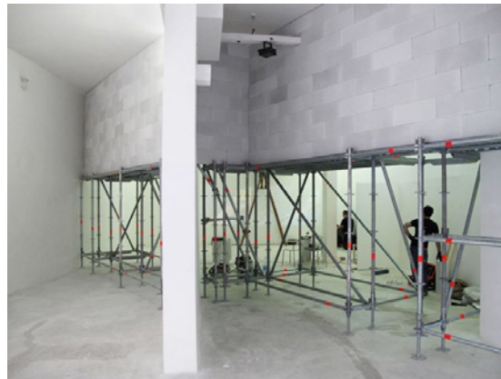
galleria 48° Neon Gallery Bologna, Italy 2009